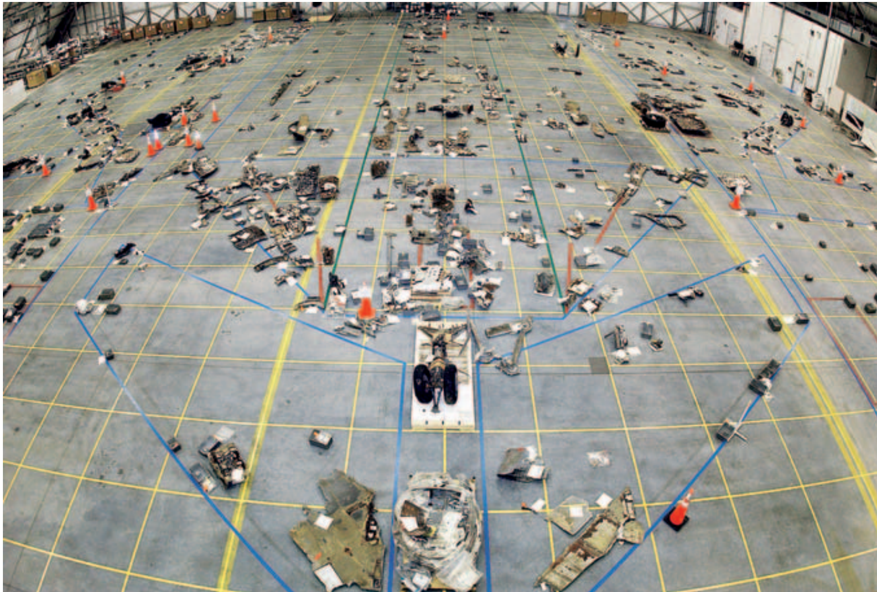
Hangar at Kennedy Space Center in Cape Canaveral, Florida, March 7, 2003, photo © NASA/Getty Images ■ NASA crash investigators place debris from the Space Shuttle Columbia onto a grid on the floor of a hangar. NASA is attempting to reassemble debris from the shuttle to learn what caused Columbia to break-up during reentry. NASA Mission Control lost contact with the Space Shuttle Columbia during the reentry phase of mission STS-107 on February 1, 2003 and later learned that the shuttle had broken up over Texas. Debris from the wreckage drifted hundreds of miles from central Texas to Louisiana. All seven astronauts onboard the shuttle died in the crash.

more interesting, variegated, uncertain, complicated, far reaching, heterogeneous, risky, historical, local, material and networky than the pathetic version offered for too long by philosophers. Rocks are not simply there to be kicked at, desks to be thumped at. “Facts are facts are facts”? Yes, but they are also a lot of other things in addition . 13