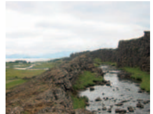
Althing in Thingvellir (þingvellir), Iceland, ■ In 930 A.D. chieftains in Iceland gathered in a natural amphitheater and formed the world's first parliament, the Althing. The meeting place was called Thingvellir (“parliament plains”), and over the next 300 years representatives journeyed here once a year to elect leaders, argue cases, and settle disputes.

The problem is that transparent, unmediated, undisputable facts have recently become rarer and rarer. To provide complete undisputable proof has become a rather messy, pesky, risky business. And to offer a public proof, big enough and certain enough to convince the whole world of the presence of a phenomenon or of a looming danger, seems now almost beyond reach – and always was. 10 The same American administration that was content with a few blurry slides “proving” the presence of non-existing weapons in Iraq is happy to put scare quotes around the proof of much vaster, better validated, more imminent threats, such as global climate change, diminishing oil reserves, increasing inequality. Is it not time to say: “Mr. Powell, given what you have done with facts,