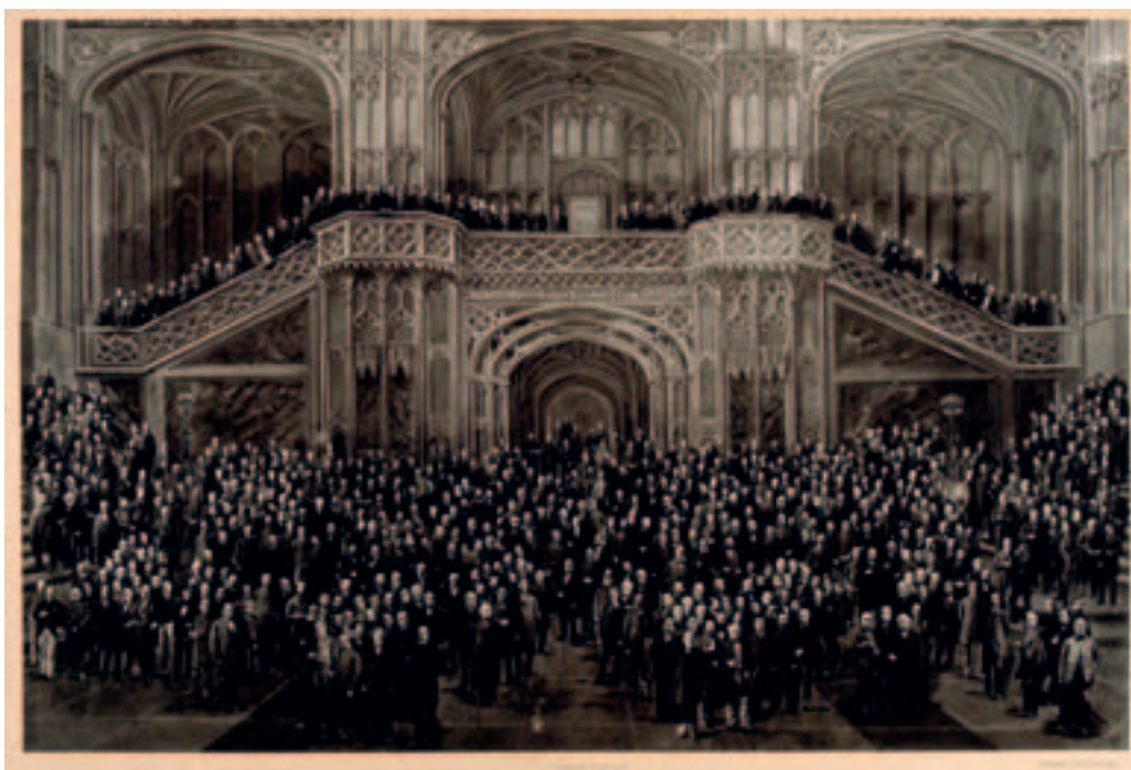
Members of the International Medical Congress, London, 1881, photoprint, February, 25, 1882, 47.6 x 72 cm, Wellcome Library, London, photo © Wellcome Library, London

an angel to come down and suspend in mid-air the arm that held the hammer, an angel that could mutter in the ear of the triumphant idol-breakers: “Beware! Consider what you strike at with so much glee. Look first at what you might risk destroying instead! ” Once the destructive gesture was suspended, we discovered that no iconoclast had ever struck at the right target. Their blows always drifted sideways. For this reason, even St. George, we thought, looked more interesting without his spear. 38