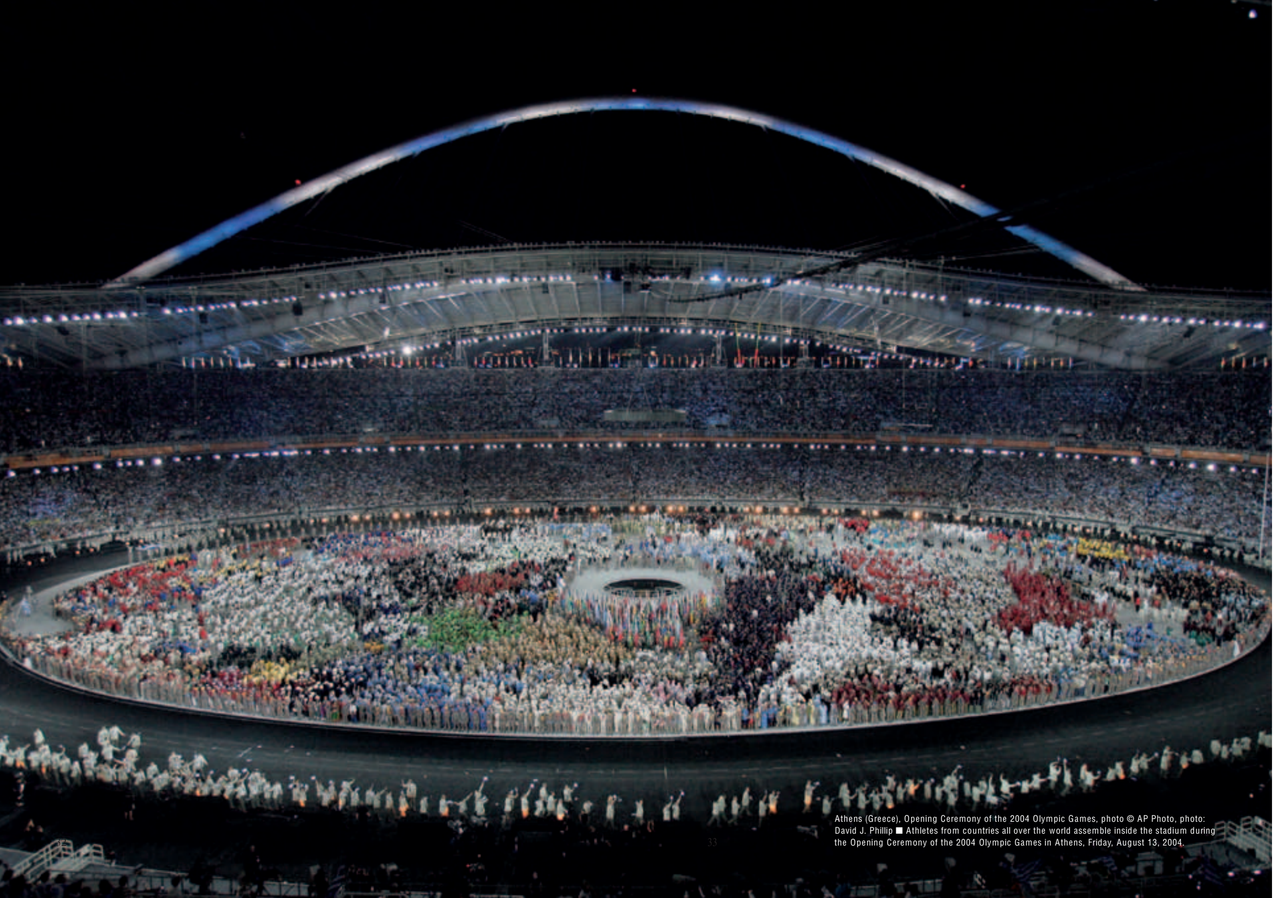
Athens (Greece), Opening Ceremony of the 2004 Olympic Games ■ Athletes from countries all over the world assemble inside the stadium during the Opening Ceremony of the 2004 Olympic Games in Athens, Friday, August 13, 2004.