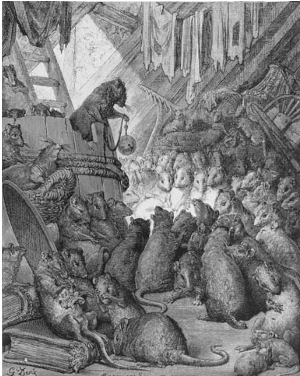
The rats council, fables from La Fontaine, illustrations by Gustave Doré, 1868, Bibliothèque Nationale de France

That we have to find a way out is forced upon us by what is called “globalization”: even though the Jivaros, the Chinese, the Japanese, the faithful members of the Oumma, the born-again Christians don’t want to enter under the same dome, they are still, willingly or unwillingly, connected by the very expansion of those makeshift assemblies we call markets, technologies, science, ecological crises, wars and terrorist networks. In other words, the many differing assemblages we have gathered under the roof of ZKM are already connecting people no matter how much they don’t feel assembled by any common politics. The shape of the dome might be contested, because it does not allow enough room for differences and indifference, but that there is something at work that is called “global” is not in question. It’s simply that our usual definitions of politics have not caught up yet with the masses of linkages already established.