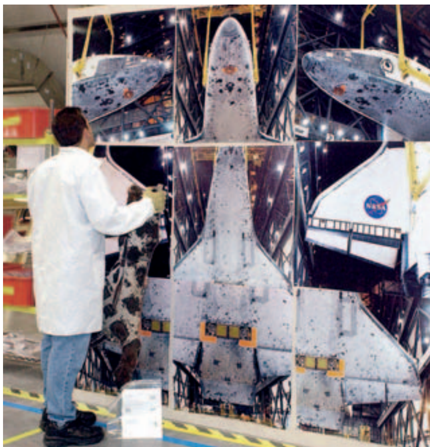
NASA Crash Investigator, Kennedy Space Center in Cape Canaveral, Florida, March 11, 2003. ■ A member of the space shuttle reconstruction project team holds a piece of wreckage and tries to locate it on pictures of Columbia taken while the orbiter was in the vehicle assembly building.

equipment. No unmediated access to agreement; no unmediated access to the facts of the matter. After all, we are used to rather arcane procedures for voting and electing. Why should we suddenly imagine an eloquence so devoid of means, tools, tropes, tricks and knacks that it would bring the facts into the arenas through some uniquely magical transparent idiom? If politics is earthly, so is science.