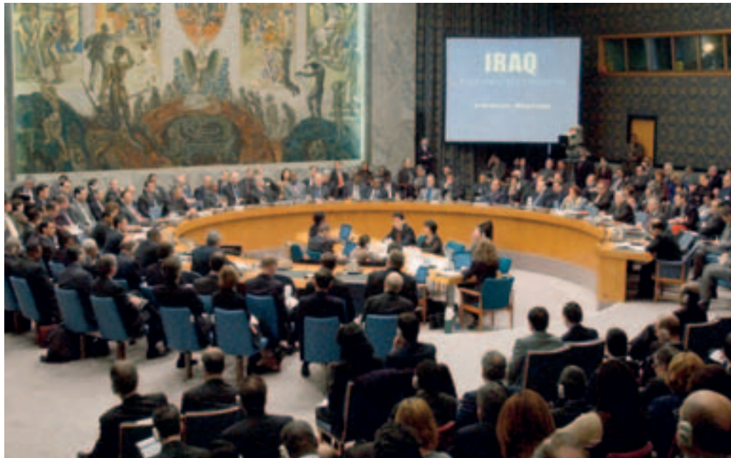
The United Nations Security Council meets at the UN headquarters to hear evidence of Iraq's weapons program presented by US Secretary of State Colin Powell Wednesday, February 5, 2003, © AP Photo / Richard Drew

and take your seat, your finger still red from the indelible ink that proves you have exercised your voting duty, instant democracy would thus be delivered! The lesson of this simile is easy to draw. To imagine a parliament without its material set of complex instruments, “air-conditioning” pumps, local ecological requirements, material infrastructure, and long-held habits is as ludicrous as to try to parachute such an inflatable parliament into the middle of Iraq. By contrast, probing an object-oriented democracy is to research what are the material conditions that may render the air breathable again.