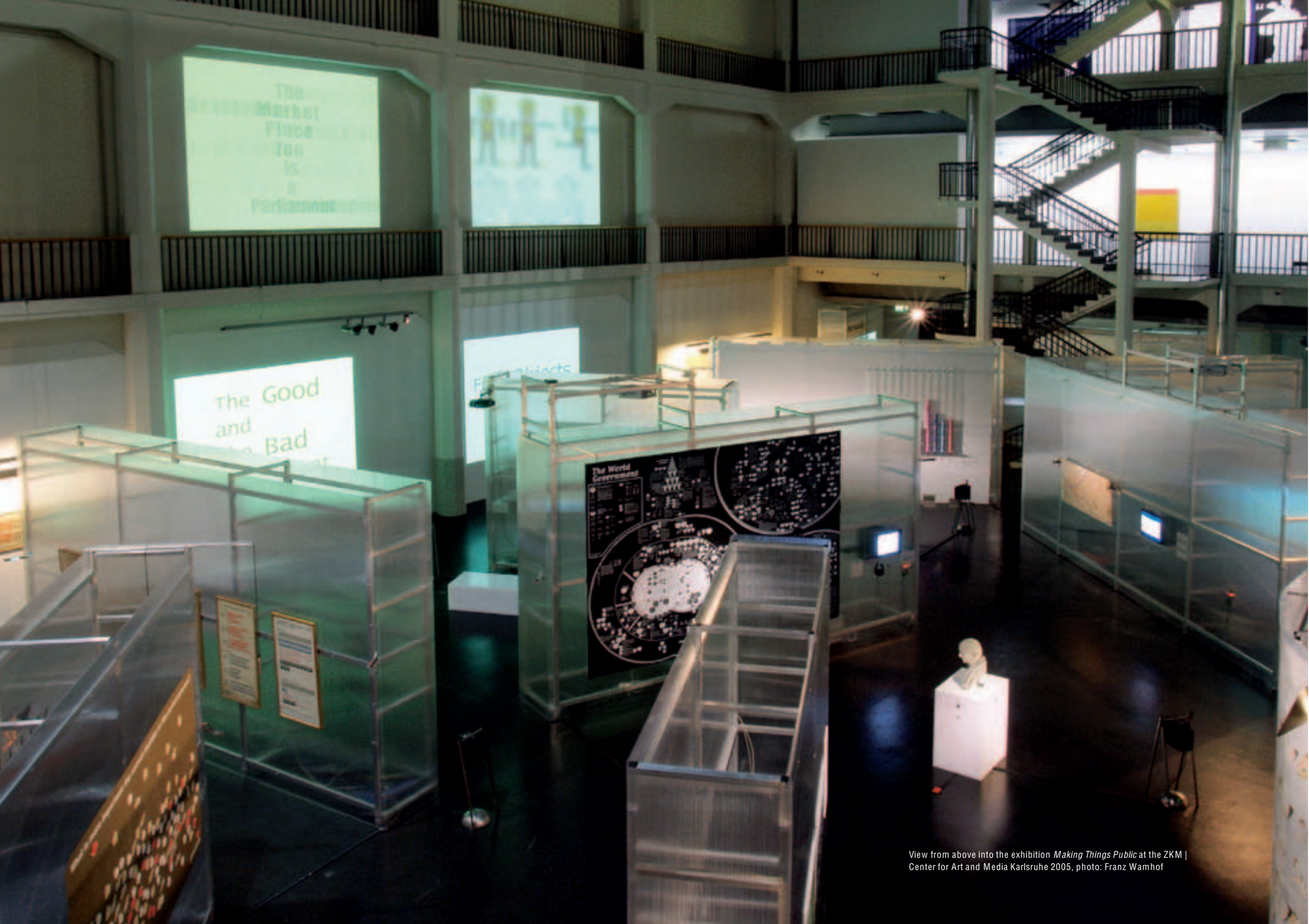
View from above into the exhibition Making Things Public at the ZKM | Center for Art and Media Karlsruhe 2005