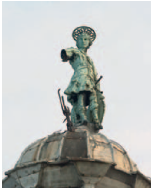
Saint George, San Giorgio Maggiore, Venice

Right page: "Moyens expéditifs du peuple français pour démeubler un aristocrate" [The French people's quick measure of removing an aristocracy], Révolutions de France et de Brabant , engraving, illustration 52, the Houghton Library, Harvard University ■ While sacking a noble's house, the mob is taking a careful look at what they throw out of the windows, creating, involuntarily, a Thing around which they assemble.