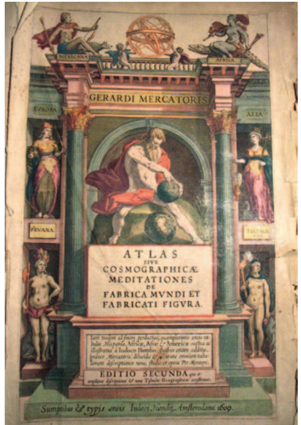
The Mercator Atlas, 1609, 2nd edition – republication by Jodocus Hondius, frontispiece, engraving by Gerard Mercator hand-colored, 45 x 75 cm, private collection, photo © Bruno Latour